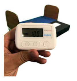
Optional Pager System