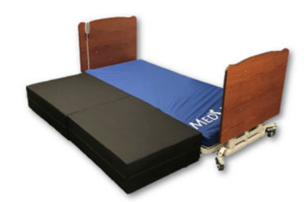
Optional Bi-Fold Safety Mat (same height as 6" mattress)