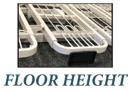
3.6" floor level height (around the width of a smartphone)